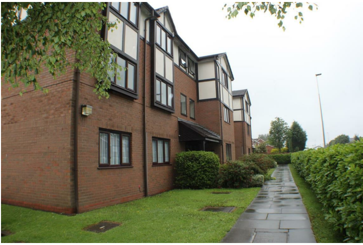
Car parking at side of development. Surrounding grassed gardens. Communal entrance.