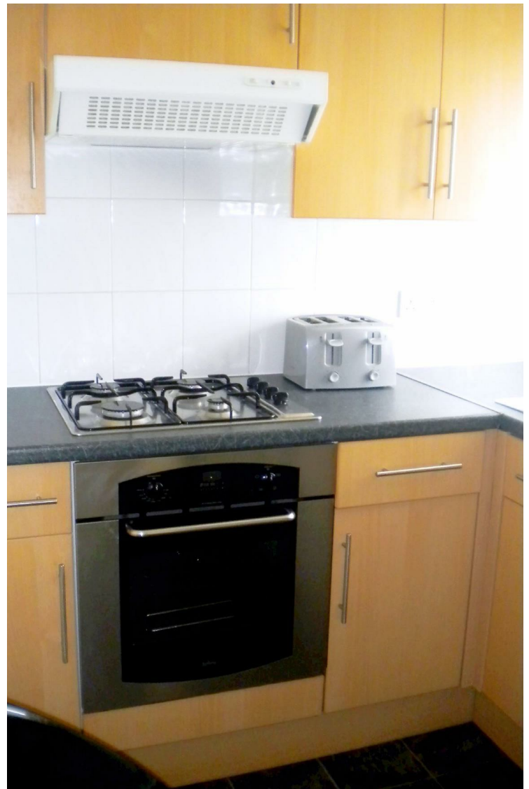
Neutral paintwork and white splashbacks. Dark worktops and light wood coloured wall and base units