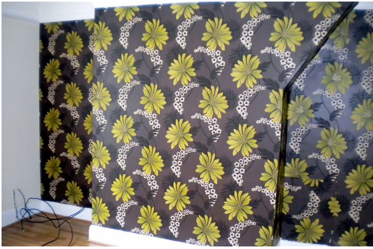
White painted walls with feature walls wall papered. Wood look flooring.