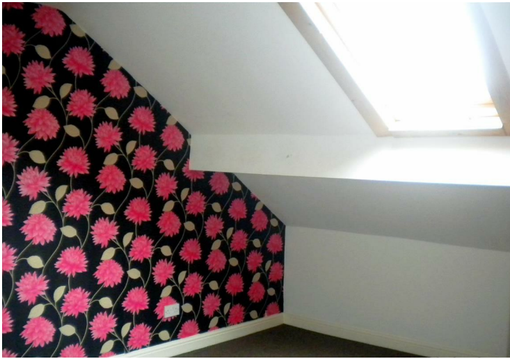
White painted walls with feature wall, wall papered. Dark flooring carpeted