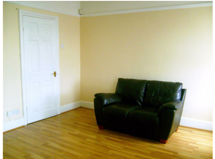
Neutral painted walls with wood look flooring