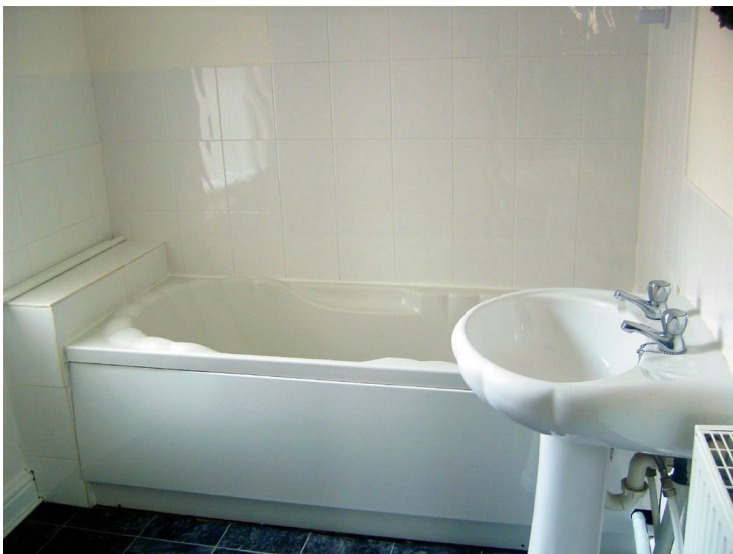
Dark flooring, white 3 piece suite, neutral painted walls with white splashbacks