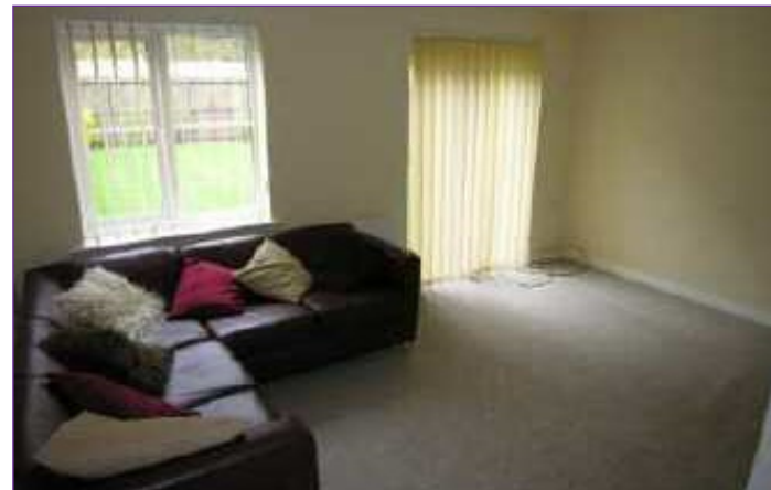
LOUNGE/ DINING ROOM