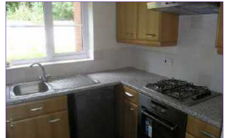
MODERN FITTED KITCHEN