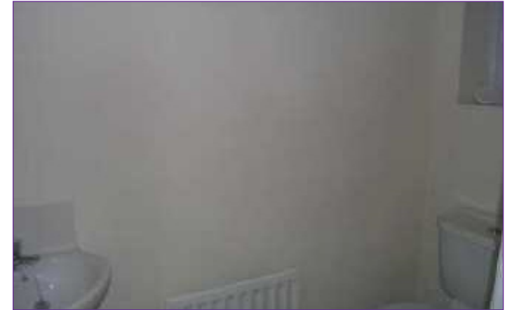
GUEST W C