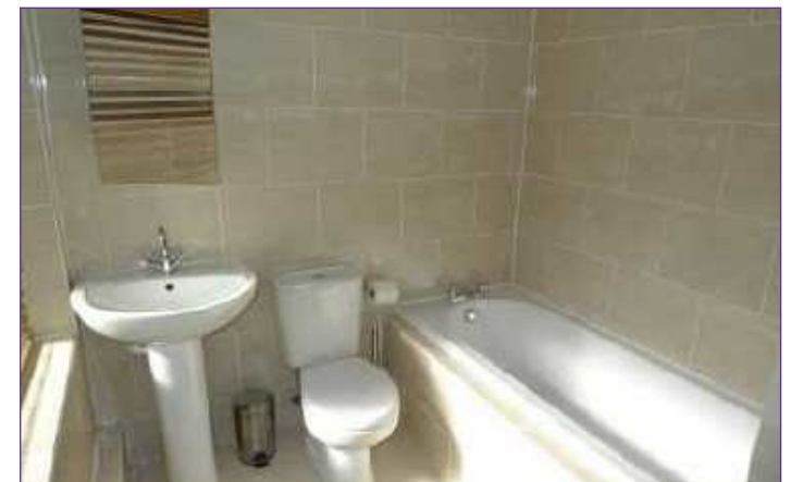
MODERN FAMILY BATHROOM