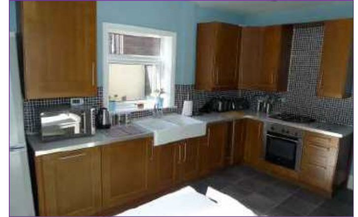
MODERN DINING KITCHEN