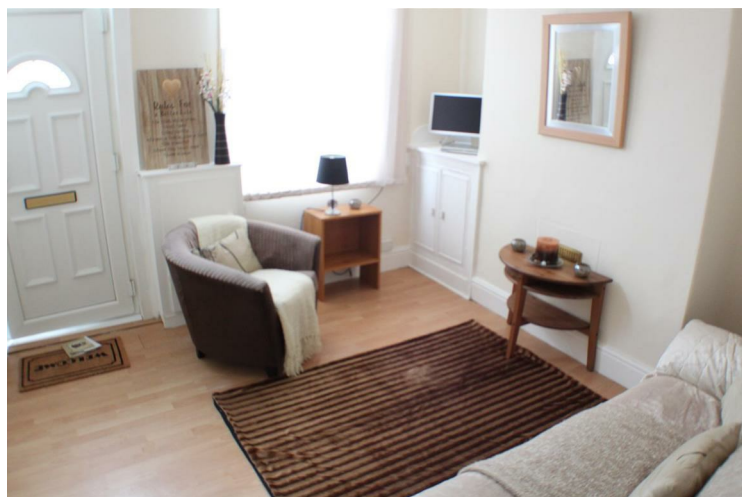
Front facing window.