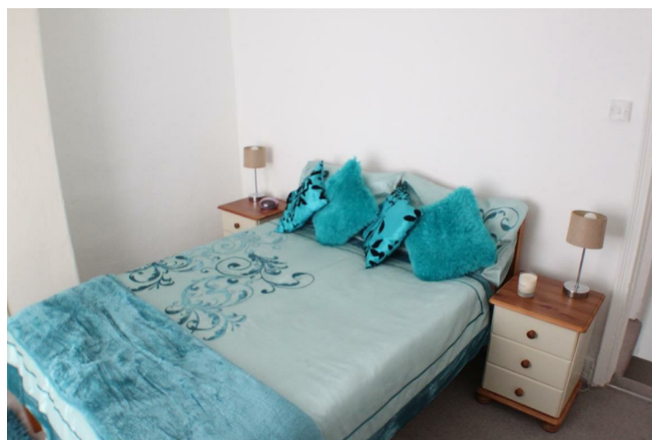
Front facing window, radiator and carpet flooring.