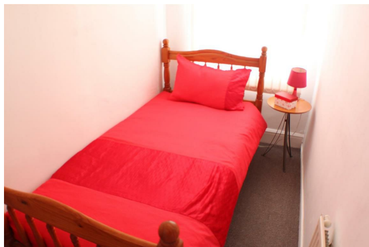
Rear facing window, radiator and carpeted flooring.