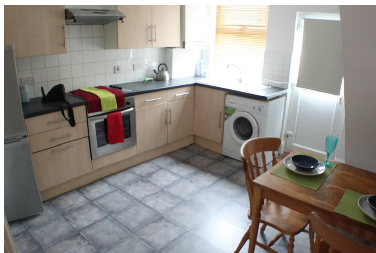
Floor standing and wall mounted units with a stainless steel sink and drainer. Electric oven and hob with appliance space, a rear window and rear external door and lino flooring.