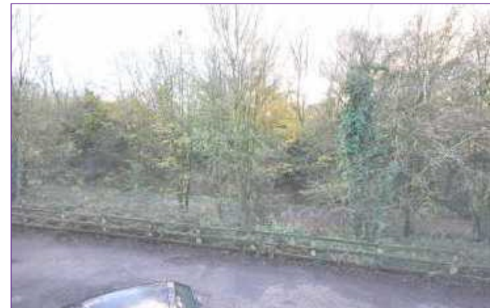
VIEW TO FRONT