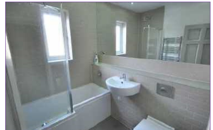
MODERN FAMILY BATHROOM