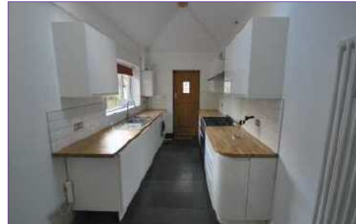
MODERN FITTED KITCHEN