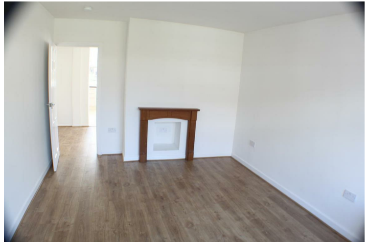
Power points, Tv aerial, radiator, square bay window to the front aspect, laminate flooring and inset space for electric fire.