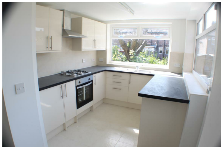
Floor standing and wall mounted units in cream high gloss with black co-ordinating work surfaces and stainless steel sink & drainer. Dual aspect windows to the side and rear, and side facing external door. Gas hob with electric oven and extractor hood. With room for appliances and part tiled.