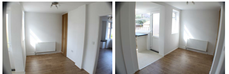
Power points, radiator, rear aspect window, laminate flooring, under stairs storage and open plan into kitchen.