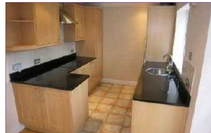
MODERN FITTED KITCHEN